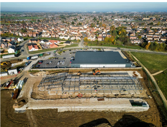
Scartho Gateway Academy, taking shape off Matthew Telford Park on Scartho Top.