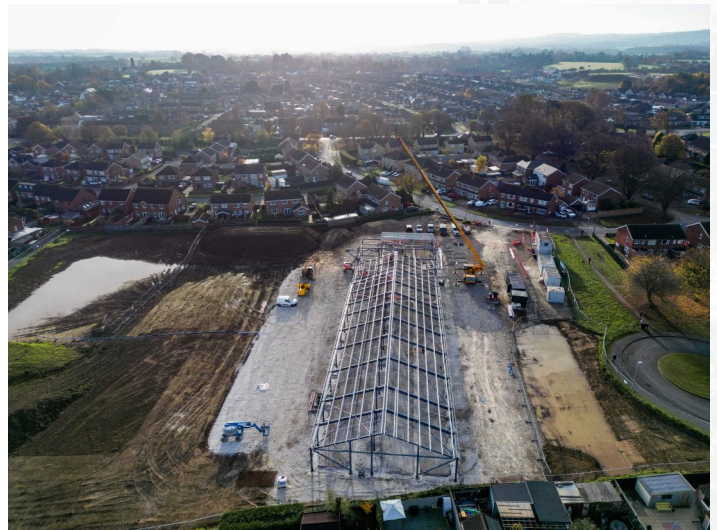
The new school in Waltham that is on land off Sunningdale.

This follows similar successful events held two months ago in Waltham and Scartho.