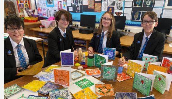
Students making Christmas cards for the Year 6 students to welcome them to our Academy.